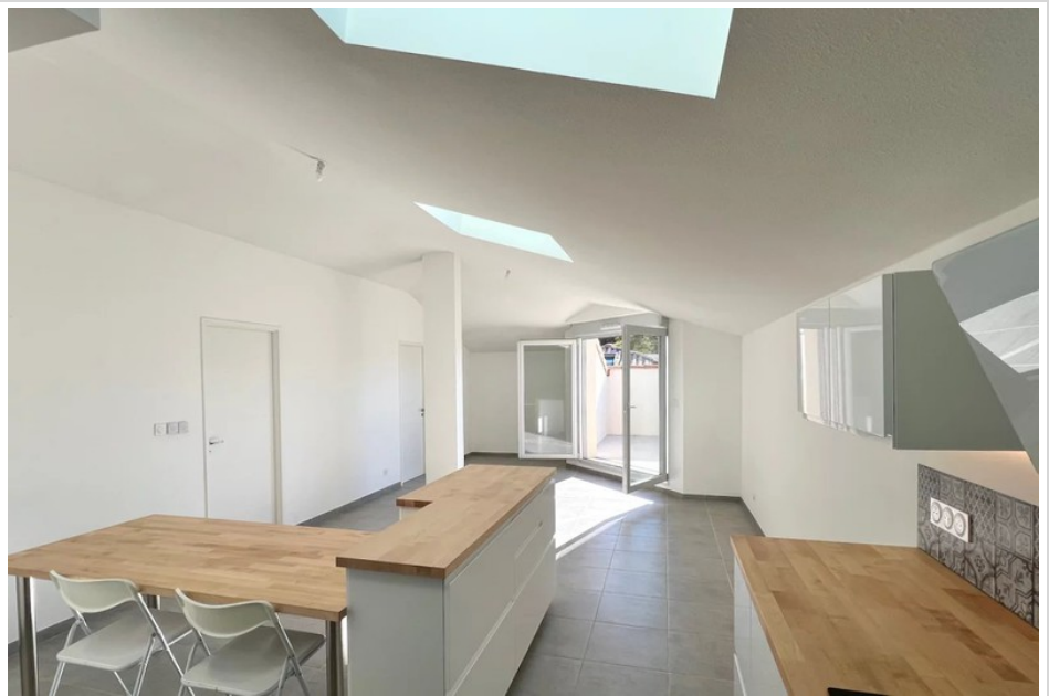
Apartment 579 Cogolin